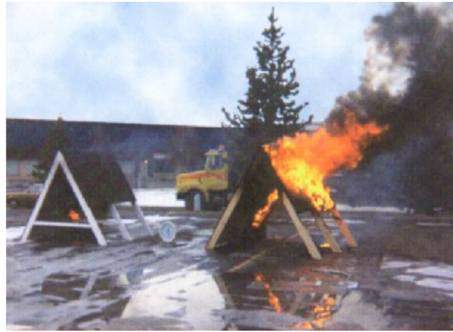
SafeCoat® coated interior roof space and an untreated roof space under identical fire conditions

manufacturers in their products or systems. Whether ASTM, UL, CSA, NFPA or other codes, SafeCoat® Latex can help you meet code requirements.